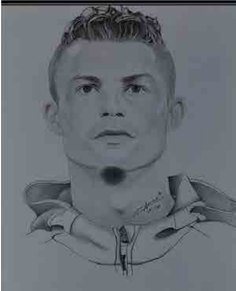
Drawing by Abishek S, S4 HM-A

So hold it close, this tender spark, Let it warm your weary soul, Believe, even in the dark, Hope's flame will make you whole.