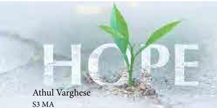
Athul Varghese S3 MA

It whispers tales of sunlit dawn, Of gardens where laughter takes its flight, Of burdens gently lifted, gone, And paths bathed in a gentle light.