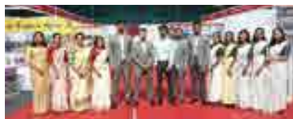
Industrial Exposure Training ( IET)