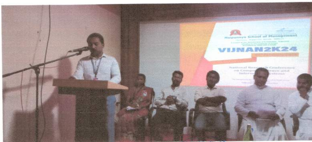
Vijnan 2k24_ National Research conference